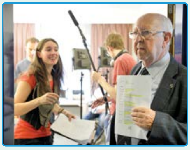
Filming by the Belgian International Academy for Film and Television (AIFT) with partner Linguapolis, Belgium

All videos have been produced to include optional subtitles, offering a degree of flexibility for teachers and learners, depending on learner needs.