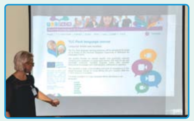
A VHS staff member presents the TLC Pack project at Expolingua in Berlin

UK: LEAP hosted a stand at the Erasmus+ dissemination conference in Birmingham, with the TLC Pack project the focal point of the stand. Members of the team were able to share project information and links with conference attendees, as well as discuss the project within two of the scheduled sessions. The event attracted around 300 visitors, many of whom represented language organisations in the UK.