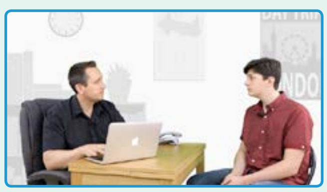
A scene from the 'Free-time activities' unit filmed by partner Language Education & Partnerships UK

The videos were shot at care centre Gitschotelhof (Zorgbedrijf), where the TLC Pack crew was warmly welcomed by both residents and care givers.