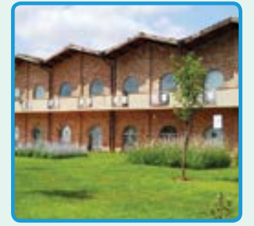
The charming ASEV offices in Empoli, Italy