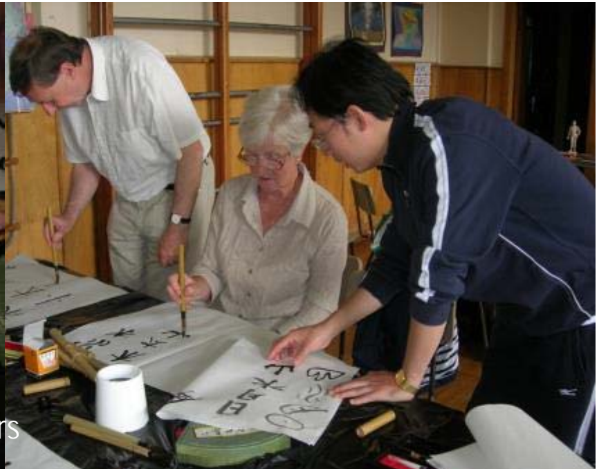
Grandparents, parents children and teachers become absorbed in the activity