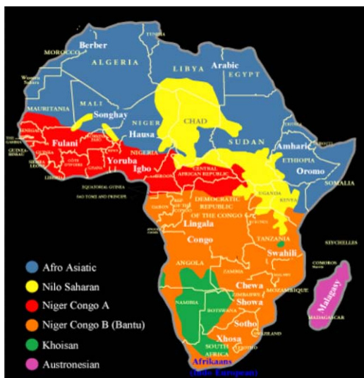
Map 1: Language Groupings in Africa