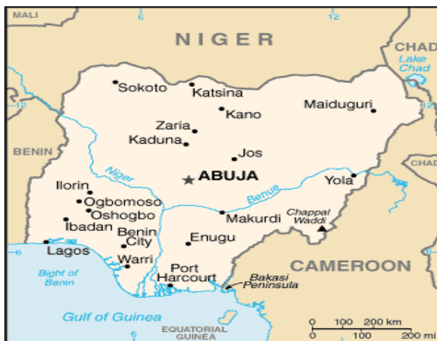
Map 2: Nigeria