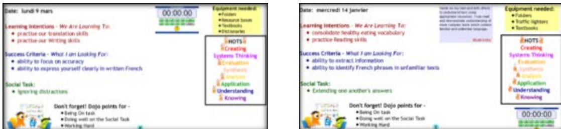
Figure 5: Standardised Presentation of Learning Intentions, Success Criteria and Social Task

When we have completed an exercise and marked in class, the Self-Assessment monitor of each group is then reminded to encourage their group to self-assess using the traffic-lighters and, if a comment is needed, the “How to self-assess” cards. Pupils then use the traffic-lighters to colour-code the L/R/W/T in the circle at the start of the activity heading. Additionally, we regularly revisit the Learning Intentions and Success Criteria and we self-assess against them using our traffic lighters. Pupils simply highlight the bullet point in the appropriate colour. If it is red, they should then use the Self-Assessment card in the box to leave a WWW/EBI comment under the exercise to alert the class teacher as to what the particular difficulty was. Similarly, after peer-assessing an exercise completed in class, learners will use the “How to peer-assess” cards to leave constructive feedback and will sign the jotters/work “PA by _____” (cf. Figure 6).