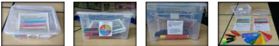
Figure 3: Resource boxes for self and peer-assessment

We use Co-Operative Learning strategies in our department and we have weekly roles and responsibilities for each group member. One of those roles is “Resource Manager” and it is their job to retrieve the Resource box for their group at the start of each lesson and any other resources listed in the “Resources Needed” box on the lesson starter page of our Interactive Whiteboard flipcharts, which will always be displayed for the class upon entering the room. It is also their responsibility to ensure everything is in the box at the end of the lesson before returning it to its storage space in the classroom. This works well as the Resource Manager knows they are accountable for anything that goes