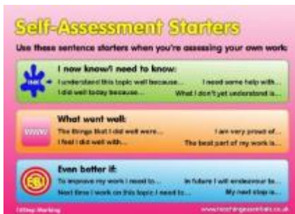
Figure 7: Starter Phrases for Self- and Peer-Assessment

Following these procedures on a lesson-by-lesson basis was initially time-consuming, but once we had the system fine-tuned and up and running, it simply became a matter of course and pupils became used to the routines. Now, when it comes to completing the monthly Quick Track, it is easy for them to quickly scan through the month's work in their jotter and decide how they are currently working, then fill out the sections of the Quick Track, which they stick in the inside back cover of their jotters, using the "How do I improve?" cards in the resource boxes for help (cf. Figure 7).