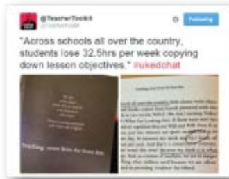
Figure 2: Tweet from @TeacherToolkit

Discussing it with colleagues at our Departmental Meeting I was reassured that we were not because our Learning Intentions and Success Criteria form an integral part of our robust Self & Peer-Assessment strategies. Copying down learning intentions and success criteria is not a stand-alone activity but just one tooth of the cog of our Self & Peer-Assessment system.