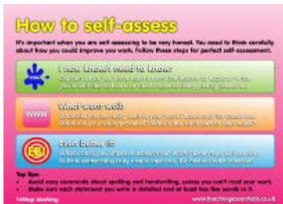
Figure 6: How-to instructions